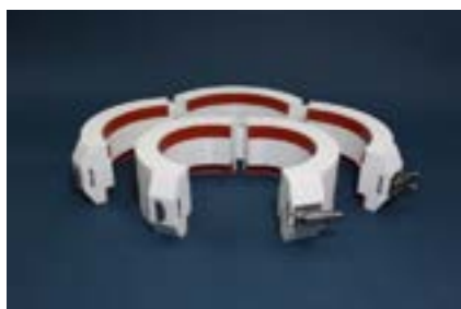
Customizable size options