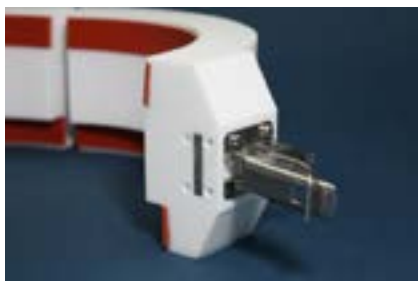
Reliable hardware mounting