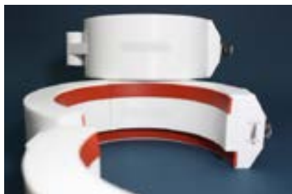
Directional Air Venting